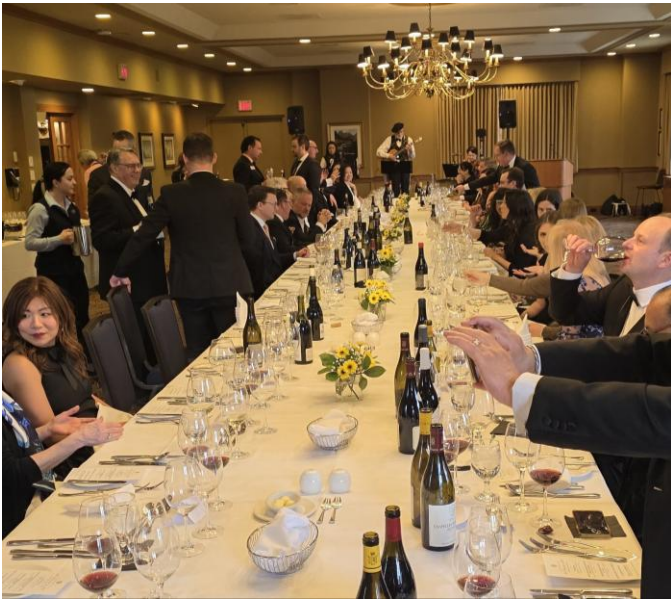
Attendees gather for La Paulée de Calgary.

Happy World Chaîne day to one and all! This year the Calgary Chaîne Bailliage was invited to share WCD as part of the Fourth Annual La Paulée de Calgary at The Ranchmen's Club. The two clubs have some membership overlap and extended the invite to the rest of our Bailliage, making the opportunity too good to miss - Celebrating WCD at a Chaîne establishment in Calgary as well as enjoying the company of fellow epicureans.