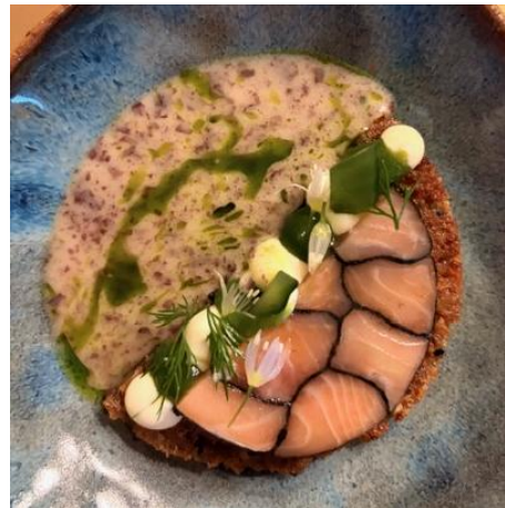
A Play on "Smørrebrød" ~ salmon mi cuit, rye bread, beurre blanc with NB seaweed, cucumber variations-Chef Jordan Holden (Atelier Tony).