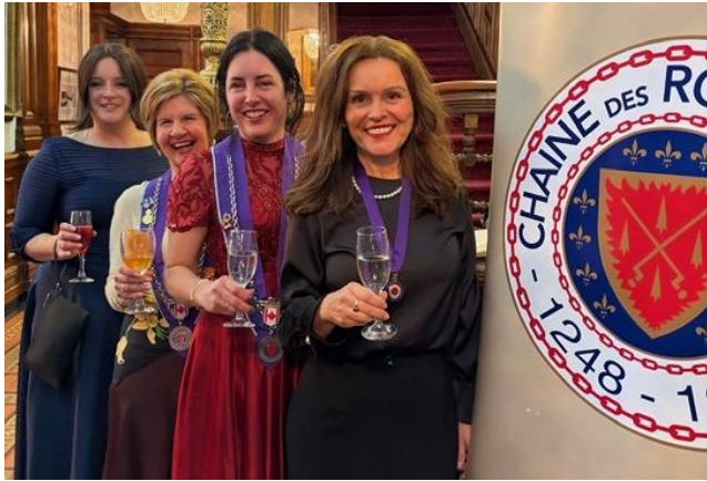
NB Chaîne members enjoying cocktail hour.

This year's World Chaîne Day brought together an inspiring celebration of camaraderie, craftsmanship, and culinary culture. Rooted in the Chaîne's spirit of fellowship, the evening highlighted the power of coming together—chefs, winemakers, and guests from Canada's East Coast, united by a shared passion for gastronomy.